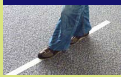
Walk and Turn Test