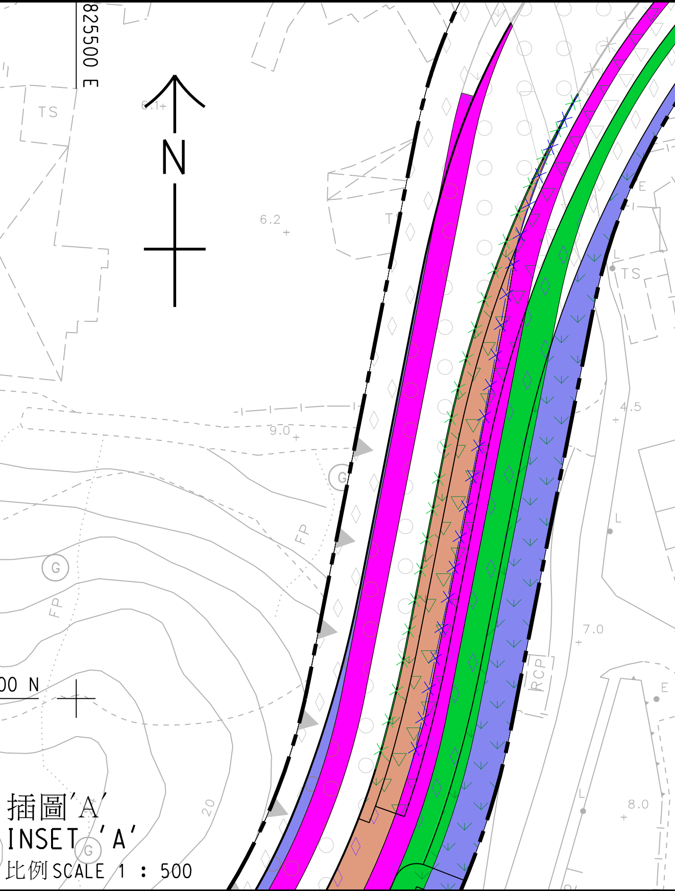
插圖'A' INSET 'A' 比例 SCALE 1 : 500

現有地面行人路將暫時封閉並修改 EXISTING AT-GRADE FOOTPATH TO BE TEMPORARILY CLOSED AND MODIFIED